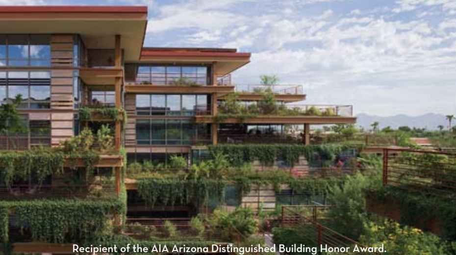
Recipient of the AIA Arizona Distinguished Building Honor Award.

TIME. THE ONLY LUXURY IN SHORT SUPPLY. LAST, MOST SPECTACULAR PHASE. CLOSEST VIEWS OF CAMELBACK.