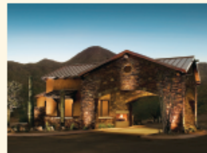
The Gate House at Eagles Nest