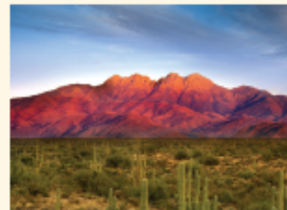
Views of Four Peaks Mountain Range

Sometimes mere words are not enough; some things have to be seen to be believed. The views from the custom home sites in Eagles Nest are unmatched in Scottsdale or anywhere else in Arizona. Far from the crowds but close to convenience, you'll find private luxury estate living in the McDowell Mountains in picturesque Fountain Hills.