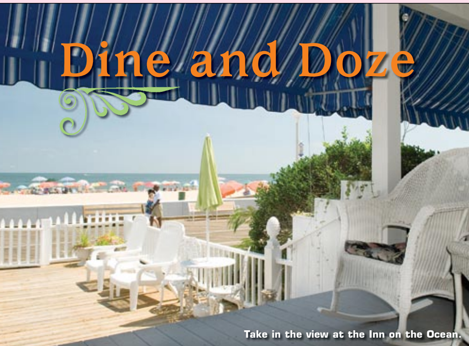
Take in the view at the Inn on the Ocean.

Whether your travels are for business or pleasure, you'll need two things: a good meal and a place to sleep. And Ocean City provides, no matter your tastes. From casual family dining to Continental specialties, from boutique hotels to full-service resorts, the area's restaurants and hotels offer something for every need.