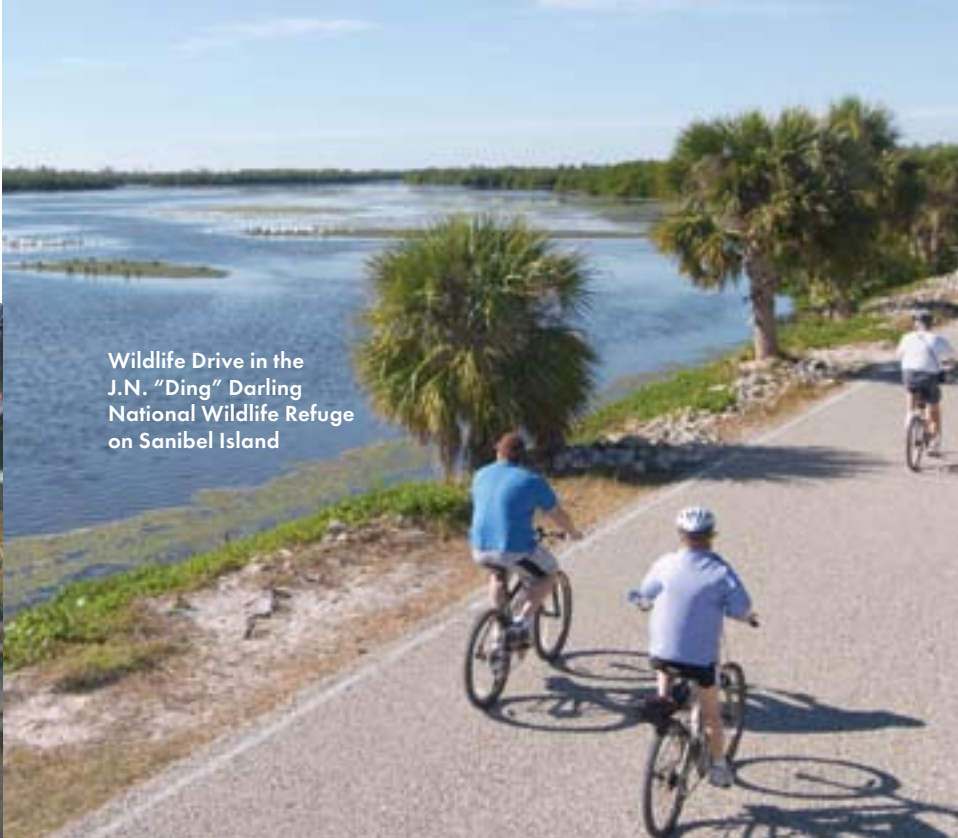
Wildlife Drive in the J.N. "Ding" Darling National Wildlife Refuge on Sanibel Island