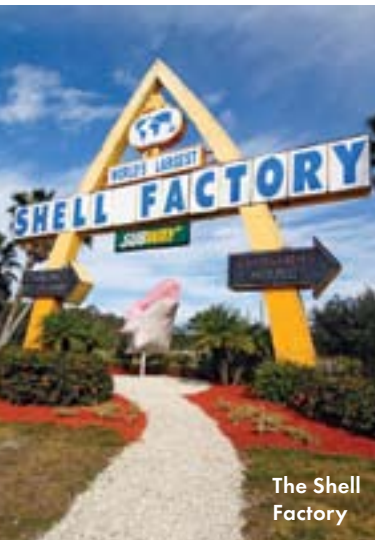
The Shell Factory