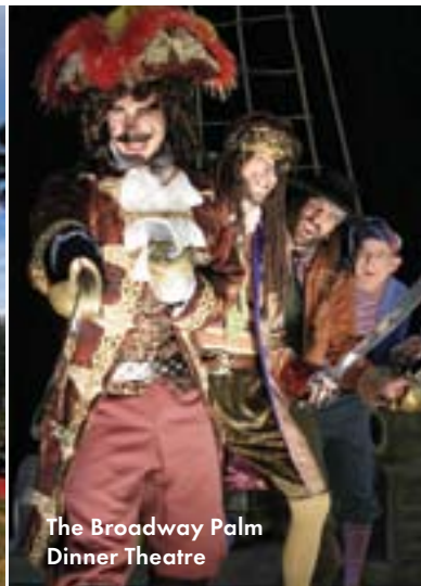
The Broadway Palm Dinner Theatre