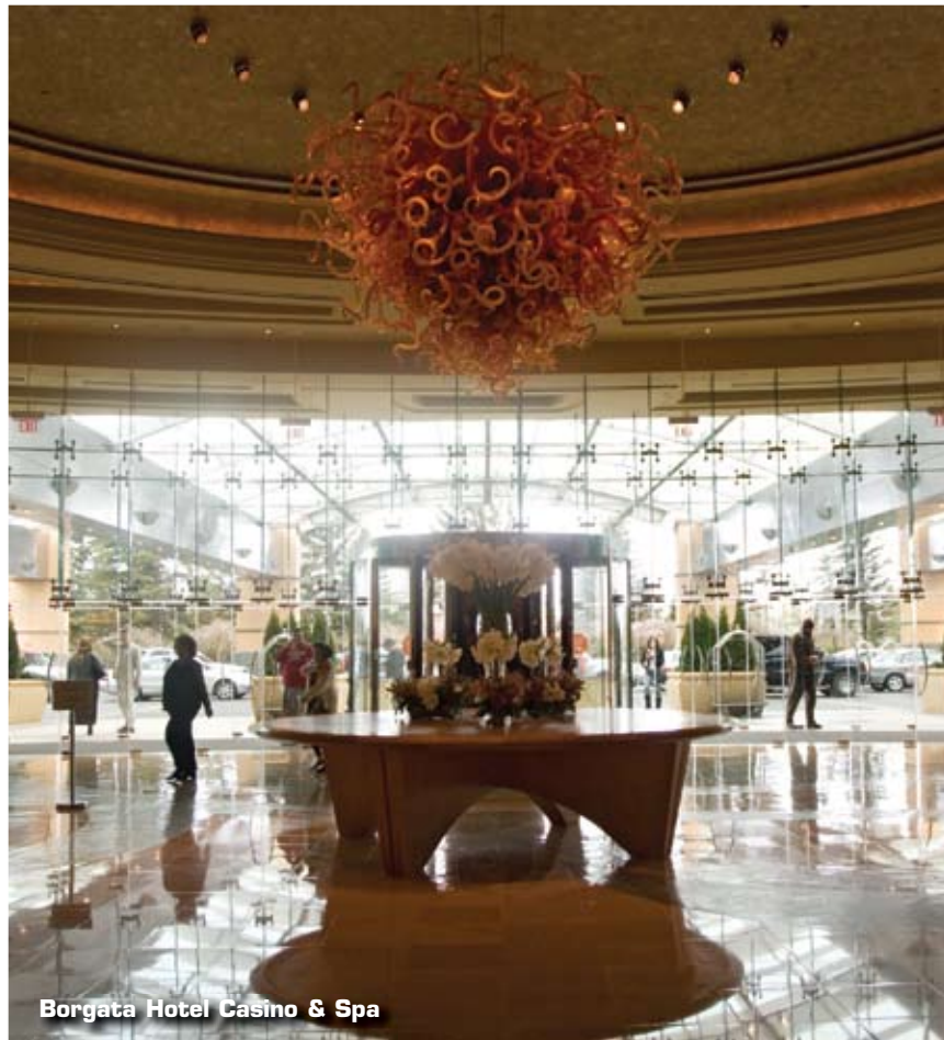
Borgata Hotel Casino & Spa

As you might expect, nighttime entertainment caters to Atlantic City's increasingly diverse crowds. They'll still find classics such as Tony Bennett and even a magic show or two. But popular artists such as Eminem, Hubastank, and Ricky Martin, along with political