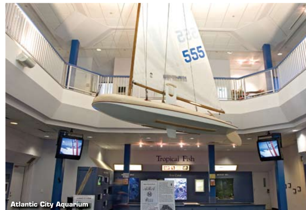
Atlantic City Aquarium