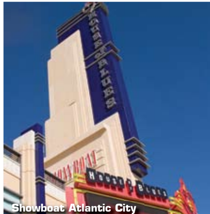
Showboat Atlantic City

Casinos must contribute 8 percent of gross gaming revenues to the Casino Revenue Fund, managed by the Casino Control Commission. More than $300 million annually is routed to programs serving New Jersey’s senior citizens and disabled. The Community Reinvestment Development Authority’s alternative revenue tax program has generated urban revitalization funds for more than 20 years. The improvements have helped shape the image of Atlantic City as a favorable place to live, work, and play.