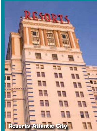
Resorts Atlantic City

AS THE FIRST casino to open its doors on the East Coast, Resorts Atlantic City set the precedent for other gaming establishments that soon popped up on the Boardwalk. But it’s not stuck in a 1970s time warp. Resorts management has always believed in enhancing the casino experience with attention to décor, amenities, and entertainment.