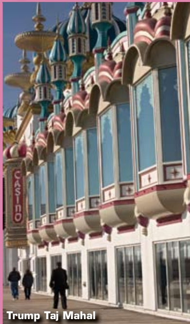
Trump Taj Mahal

BACK FROM A BANKRUPTCY reorganization and raring to go, the man who wrote The Art of the Comeback is taking a stab at one.