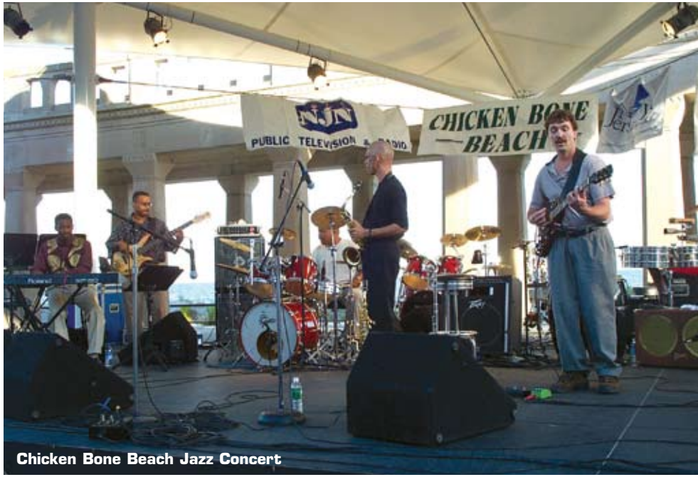
Chicken Bone Beach Jazz Concert